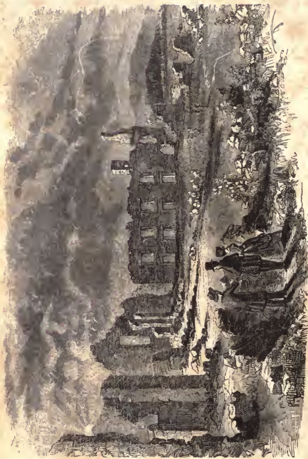
RUINS OF FORT TICONDEROGA.

(From Lossing's Field-Book of the Revolution.)